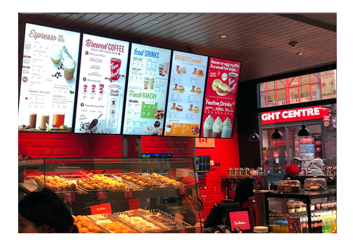
Image comparison : 1200 : 1 Angle of view : 89° (U/D/L/R) Color depth : 8bit, 16.7 million colors Timing : supported multi-time timing switch Display direction : horizontal display Management software : Store Sign Cloud Product color: black

\begin{array}{l} \textbf{CPU}: \text{T972-SR Quad-Core A55 1.9GHz} \\ \textbf{Memory}: 2GB \\ \textbf{Storage}: 8GB \\ \textbf{Operation system}: \text{Android 9.0} \\ \textbf{Sound power}: 2 \times 2W \ 4\Omega \\ \textbf{Media transfer mode}: USB, \ \text{Lan transmission}, \ Wan \ Transmission} \\ \textbf{Resolution}: 1920 \times 1080 \end{array}